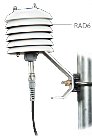
The RAD6 6-plate shield attaches to a mast by placing the U bolt in the side holes.

*Older sensors (serial numbers less than E13405) had a power supply voltage range of 6 to 18 Vdc.